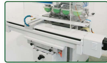
Digital shuttle for multi-color (DRE-700)