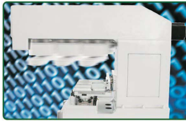
Servo drive pad carriage