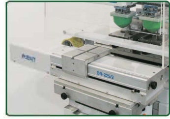
Pneumatic shuttle (2 color)