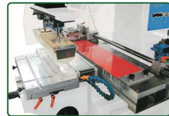
Side way ink cup for long image printing (SCMIC)