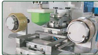
Auto pad clean