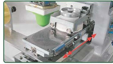
Platform in / out movement (Pad clean underneath)