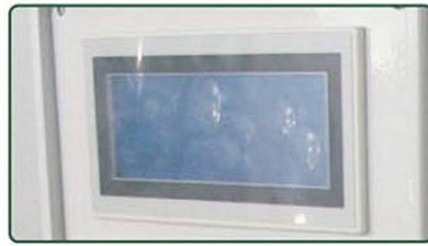
PLC control touch screen panel