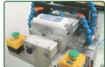
Product holding in/out shuttle