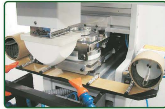
Auto pad clean